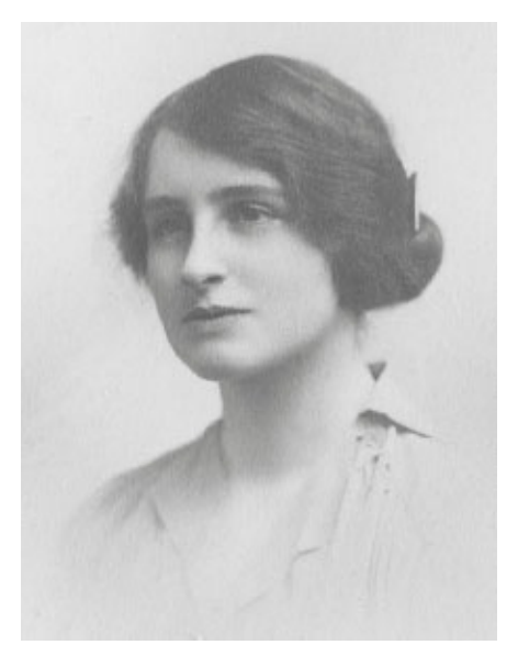
Vera Brittain, 1914.