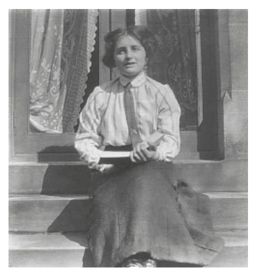
Vera Brittain in Buxton, circa 1911.