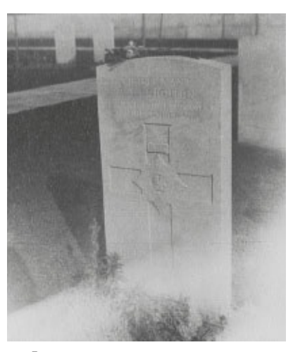
Roland's grave at Louvencourt.