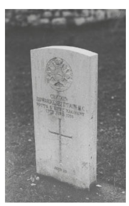
Edward's grave at Granezza on the Asiago Plateau.