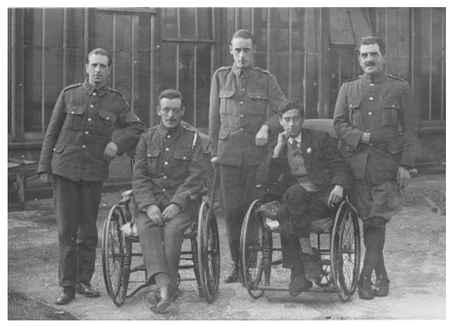
Convalescent patients at Camberwell, 1915.