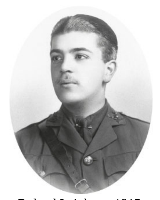
Roland Leighton, 1915.