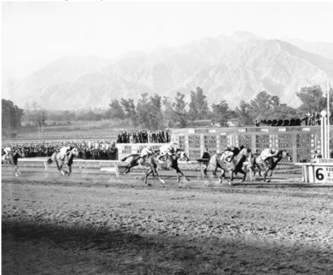
Seabiscuit and Rosemont drive toward the wire together in the 1937 hundred-grander.

"We're coming back," the old bicycle man told his friends. "And when we do, hang on to your hats." 26