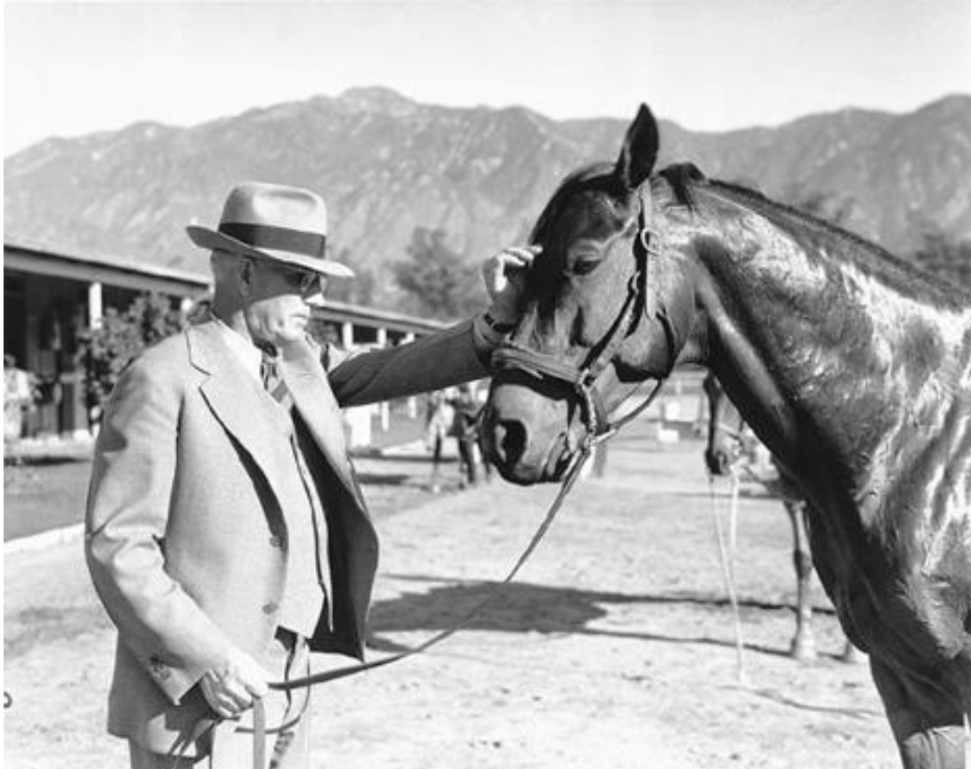
Smith and Seabiscuit