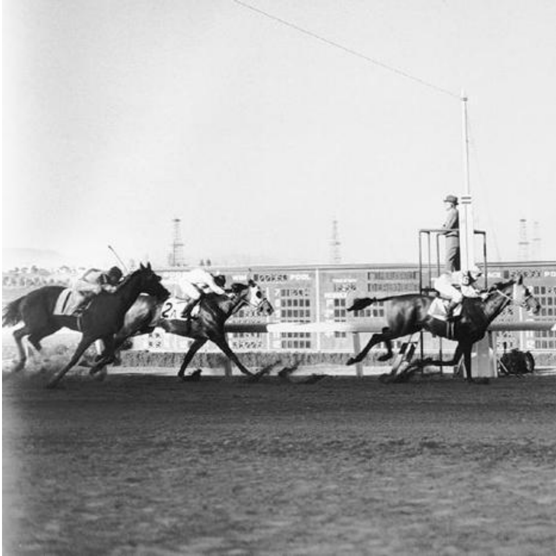
Hollywood Gold Cup, July 16, 1938