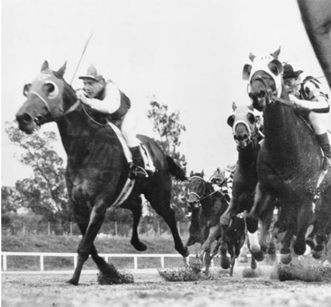
With a quarter of a mile to go, Seabiscuit (left) takes the lead in the 1938 Santa Anita Handicap. Stagehand (second from left) is directly behind him.