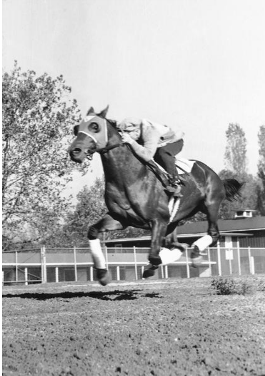
After drilling through walk-up starts with Smith's homemade bell, Wolf and Seabiscuit streak over the Pimlico track in a workout on October 26, 1938.

and lay down. By the time Smith got settled in and the train whined into motion, Seabiscuit was fast asleep.