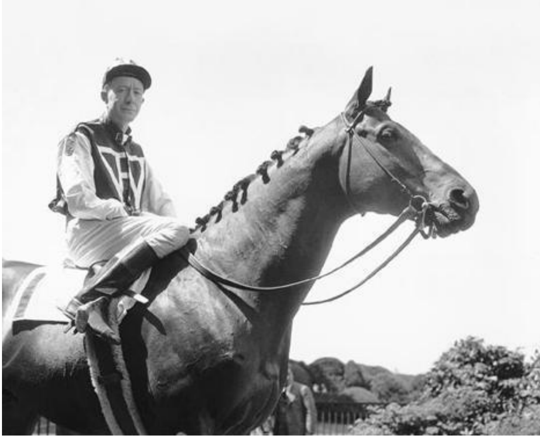
and Seabiscuit