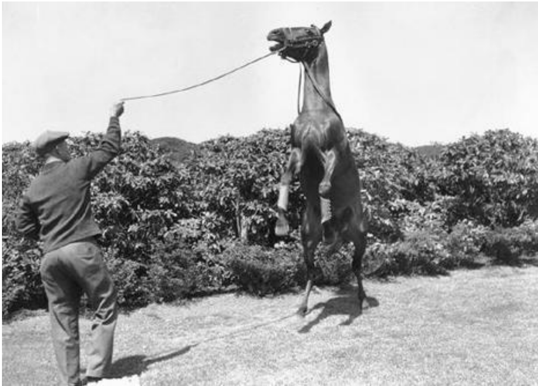
The prematch race photo session at Belmont Park, May 4, 1938: War Admiral ...