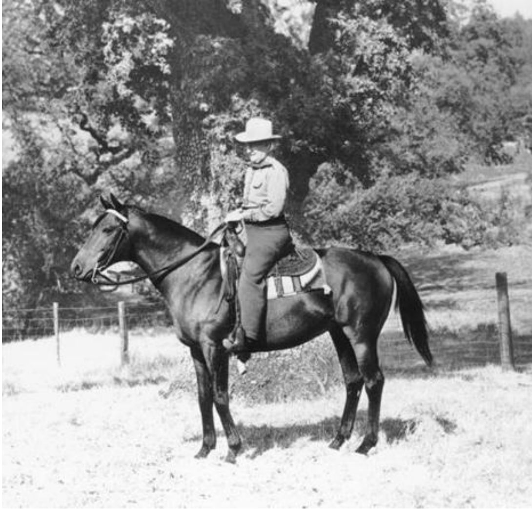
Charles Howard and Seabiscuit

1 This is no exaggeration. The six-furlong split time for the race was as fast as, or faster than, the winning time of seven of the ten previous runnings of the nation's most prestigious six-furlong stakes race, the Toboggan. Though the Santa Anita racing surface was probably somewhat faster than the Belmont surface, the Toboggan was run over a straight course, not around turns, as the Santa Anita Handicap was; as horses almost always slow down to negotiate turns, times in straight-course races tended to be considerably faster than those held around turns. Indeed, the Santa Anita split time was actually faster than the 1940 winning times of many of the nation's most prominent sprint races, including the Fall Highweight