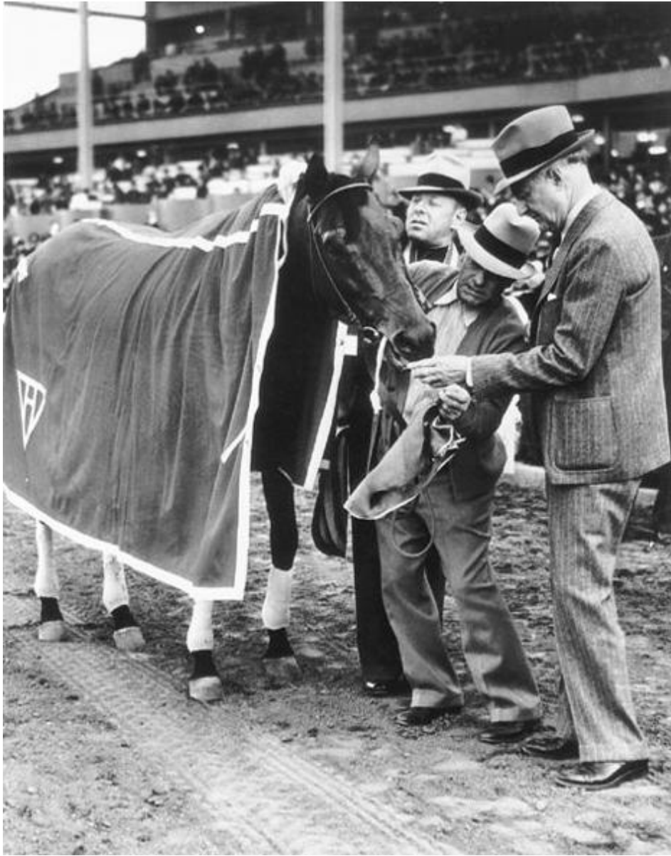
Moments after injuring his left foreleg at Santa Anita, Seabiscuit is attended by Howard (far right) and his grooms, February 14, 1939.