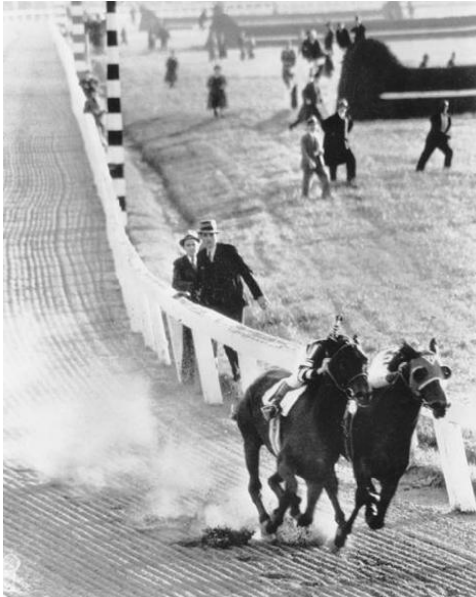
Midway through what is still widely regarded as the greatest horse race in history, Seabiscuit and War Admiral turn out of the backstretch and drive for the wire, November 1, 1938.