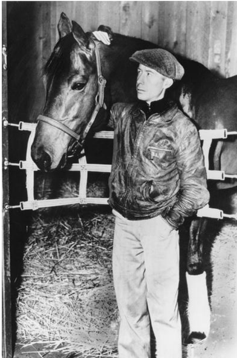
At Seabiscuit's stall, Pollard awaits Howard's decision, December 1939.