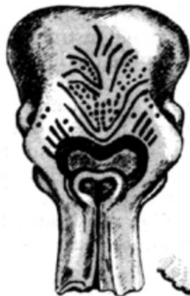
DRUM mammoth skull Mezhrick (Ukraine)