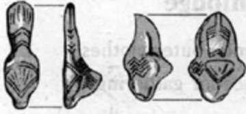
TWO BIRD-WOMAN FIGURES mammoth ivory, Mezin