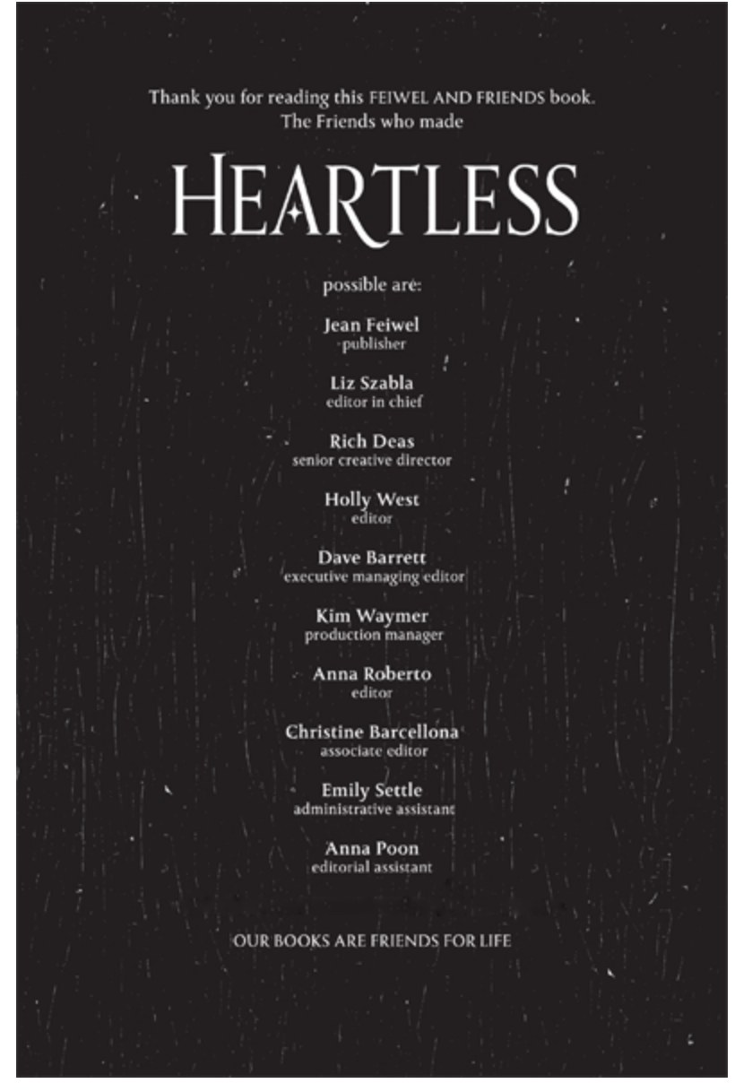
Follow us on Facebook or visit us online at mackids.com.