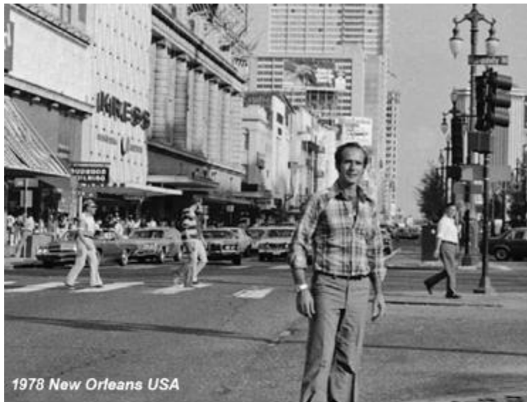
1978 New Orleans USA