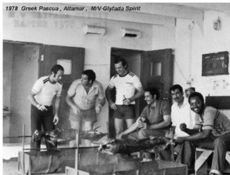
1978 Greek Pascua , Altamar , M/V Glyfada Spirit