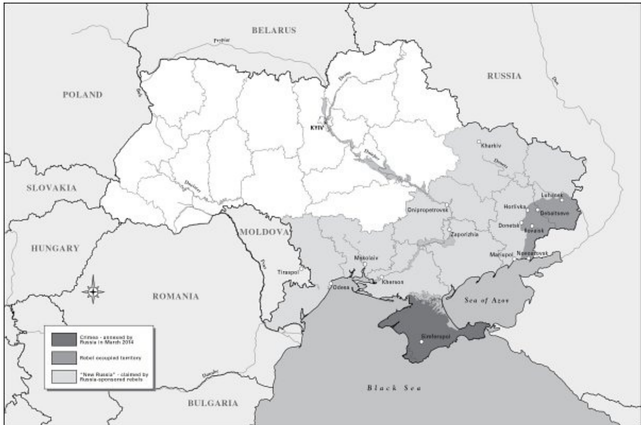
The Russo-Ukrainian Conflict