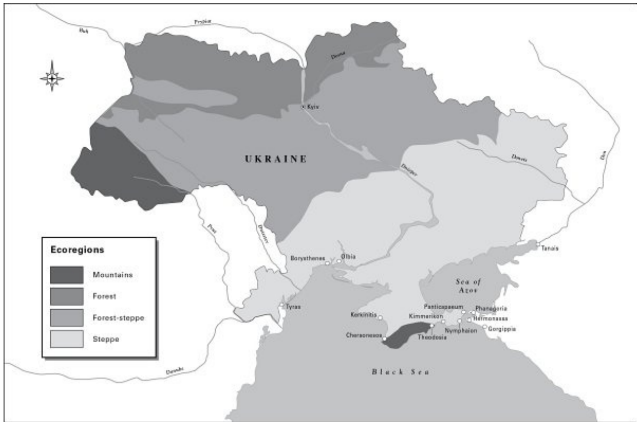
The Greek Settlements, 770 BC–100 BC