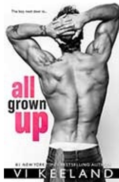
All Grown Up