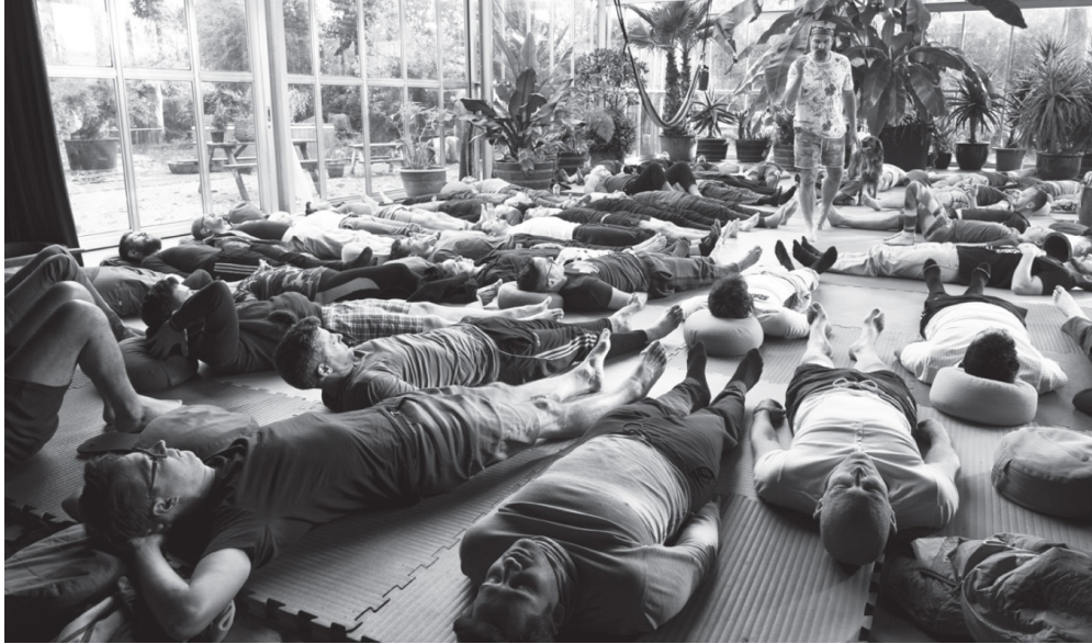
A group breathing exercise at the WHM Center in Stroe, Netherlands

When you feel a real urge to breathe again, go ahead. Breathe in once, inhaling fully, and then, when your lungs are full, stop again. You are now consciously tapping into the endocrine system and igniting the nervous system, releasing hormones and unblocking energy. Advancing in the technique, you may encounter lights, visions. It's up to you how far you want to go with this because the feeling can be rather intense. But don't hold your breath so long that you pass out. Just breathe in as soon as you feel you have to. Remember to always follow the breath as a guide and not to force it. Letting go is the key.