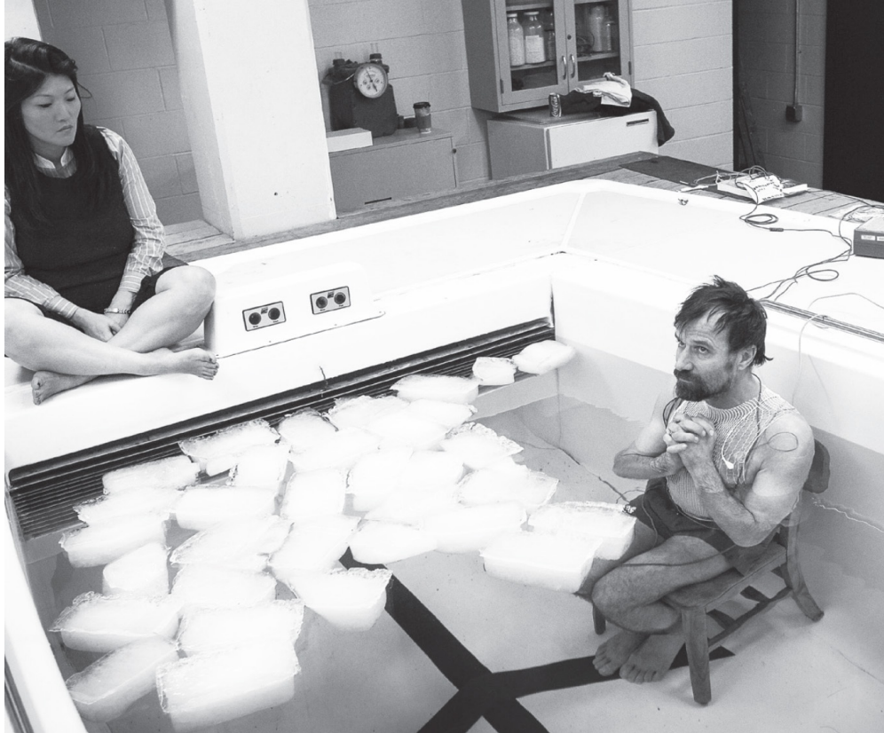
Sitting in ice water at the University of Minnesota Medical School