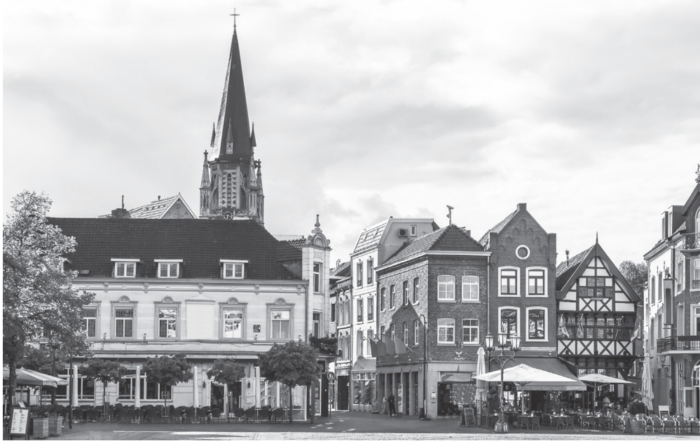
The historic market square of Sittard, my hometown in the Netherlands

Every day for five years, I woke up at 3:30 a.m. I'd roll out of my bed directly into the push-up position, do fifty push-ups, and then I'd be awake. My father would serve me and my brothers each a big cup of coffee, and we'd be out the door by 4:00 a.m. to our paper routes. It was a precise routine. Then I'd go out into the night with these packs full of newspapers, up and down the hills of Sittard. I'd hear all kinds of birds and see rabbits on the street, and it was just all so magical and contemplative. I saw and felt things that, because I was alone, didn't require words. It was just me and my bicycle and the newspapers alone in the hills. Every day for five years.