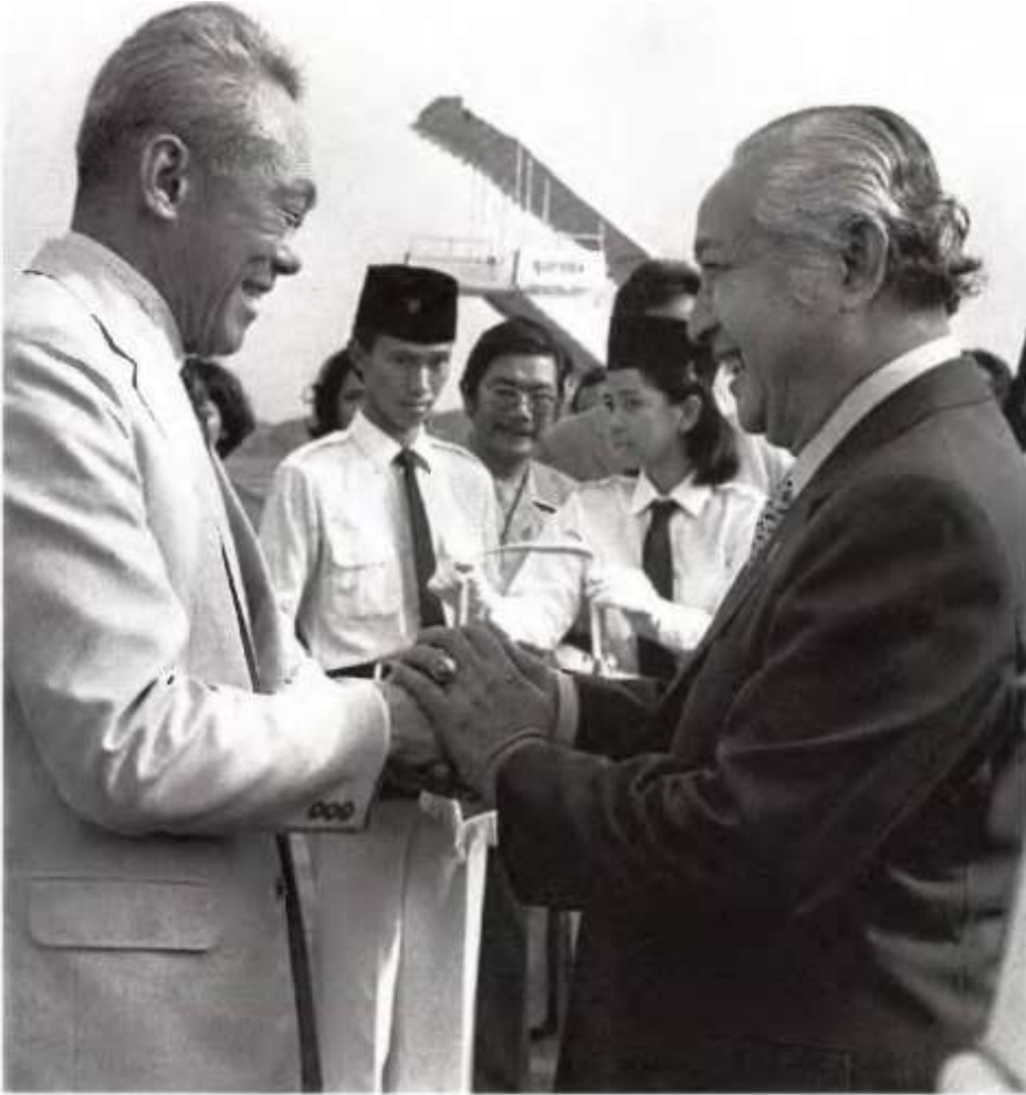
September 1982: President Suharto greeting me at the Jakarta Airport.