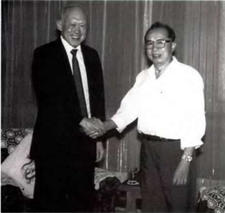
1995 : Posin g for .i hanclshake wich rhe Pl't'n (Fan t.h1 lang Pi) in Diaoymai Beijing. (SM L.e.e:r i f/// ect inn )

February 1996: Greeti ng French Presidentr Jacq ues Chi rac in Si ngapore .