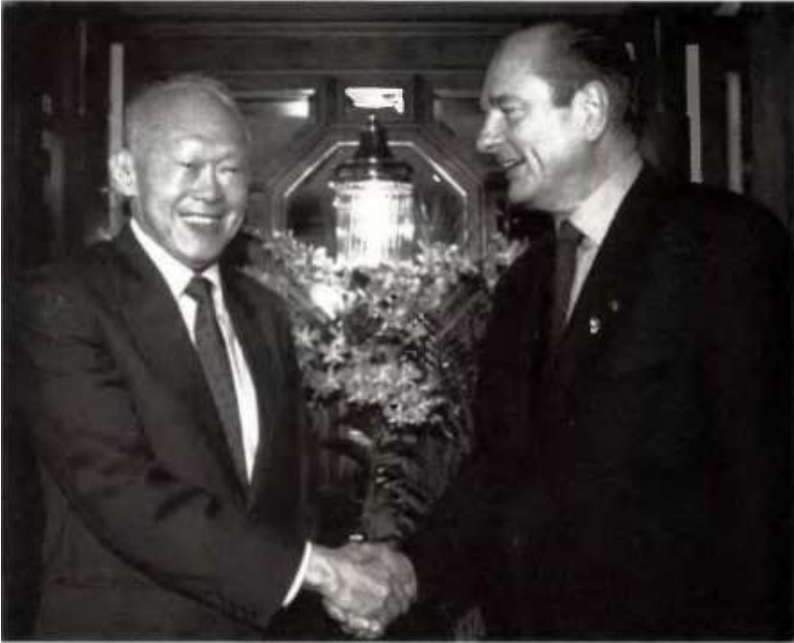
Mr. [Name] (left) and Mr. [Name] (right) shaking hands.