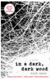
In a Dark, Dark Wood