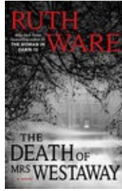
The Death of Mrs. Westaway