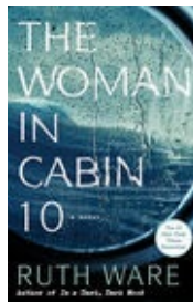
The Woman in Cabin 10