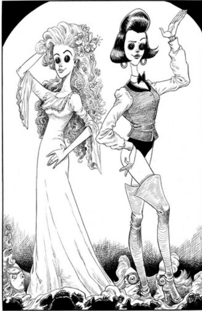
Miss Spink and Miss Forcible came on to the stage.