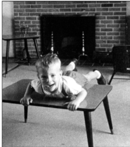
I just wanted the floating...

And he said, "That's a little transparent, don't you think?"