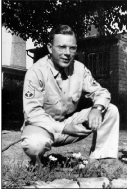
My father, in uniform.