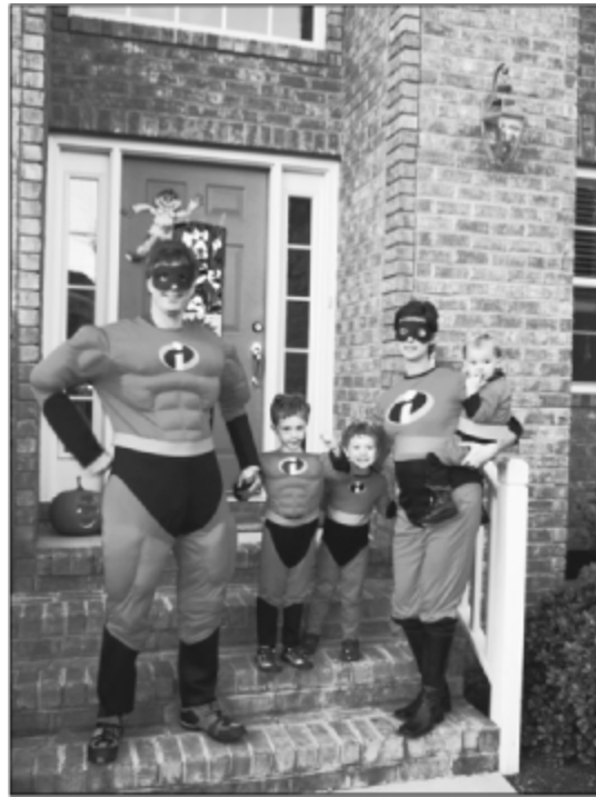
Chemo has not dramatically affected my super-powers.

We successfully avoided any emotional “I love you, man” dialogue related to my cancer. Instead, we just had fun. We reminisced, we horsed around and we made fun of each other. (Actually, it was mostly them making fun of me for the “St. Randy of Pittsburgh” reputation I’ve gotten since my last lecture. They know me, and they were having none of it.)