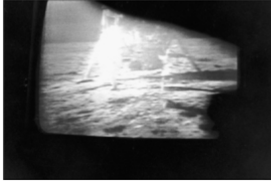
The moon landing on our television, courtesy of my father.

Give yourself permission to dream. Fuel your kids' dreams, too. Once in a while, that might even mean letting them stay up past their bedtimes.