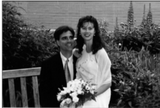
This was taken before we got into the balloon.

in her wedding dress, me in my suit, the collapsed balloon, the relieved balloonner.