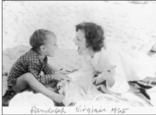
Mom and me, at the beach.

Somehow, with the passage of time, and the deadlines that life imposes, surrendering became the right thing to do.