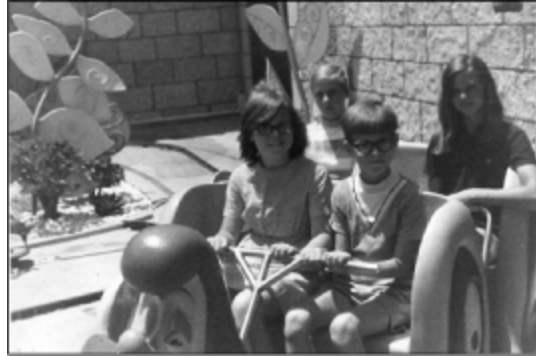
My sister and me on the Alice ride: All I could think was, "I can't wait to make stuff like this."

know that one of my star faculty members is in my office and he's really excited. So tell me more."