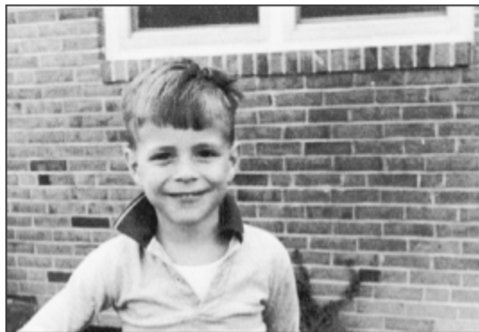
My wardrobe hasn't changed.

Think about it. Becoming an Eagle Scout is just about the only thing you can put on your resume at age fifty that you did at age fourteen—and it still impresses. (Despite my efforts at earnestness, I never did make it to Eagle Scout.)