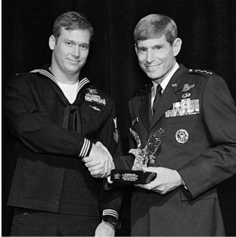
General Peter Pace, the head of the Joint Chiefs of Staff, hands me the Grateful Nation Award from JINSA, the Jewish Institute for National Security Affairs. JINSA gave me the award in 2005 in recognition of my service and achievements in Fallujah.