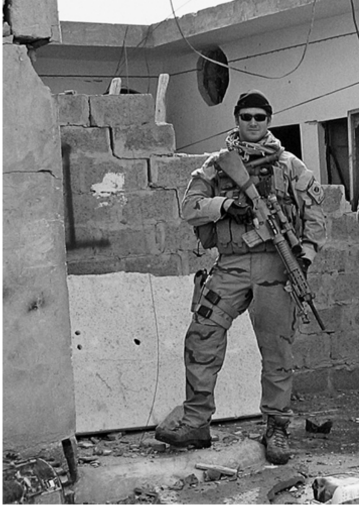
All kitted up with my Mk-12 sniper rifle, the gun I was carrying when I rescued the trapped Marines and reporters in Fallujah.