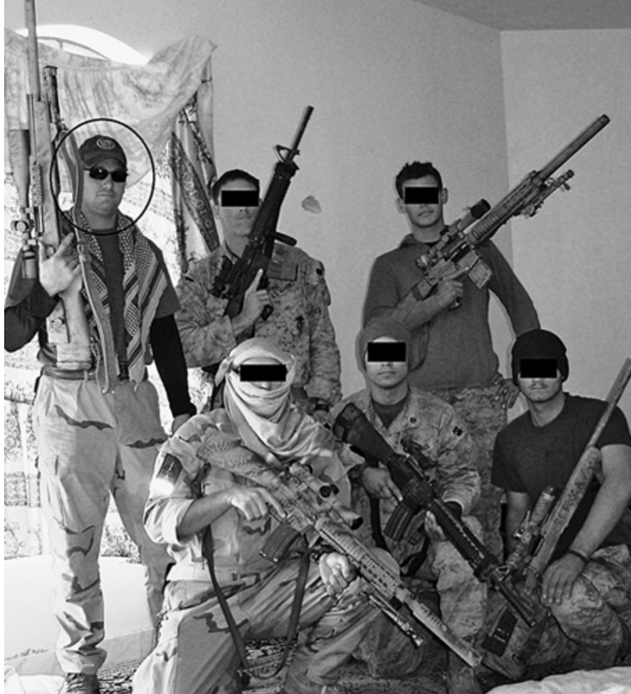
Fallujah in '04. Here I am with my .300 WinMag and some of the snipers I worked with. One was a SEAL, the others were Marines. (You can tell their service by the camis.)