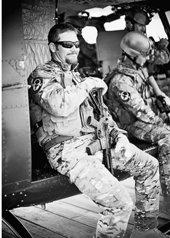
Here I am on a helo training course for Craft. I don't mind helicopters—it's heights I can't stand.