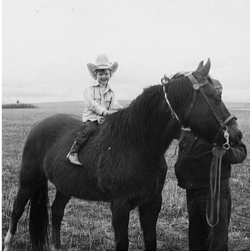
I've been a cowboy pretty much from birth. Look at those fine boots I wore as a four-year-old.