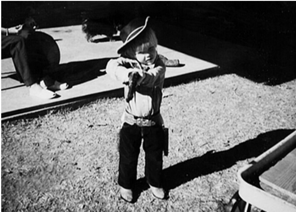
Stick 'em up, Yankee . . .