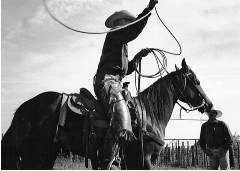
You're not a real cowboy until you learn to lasso . . .