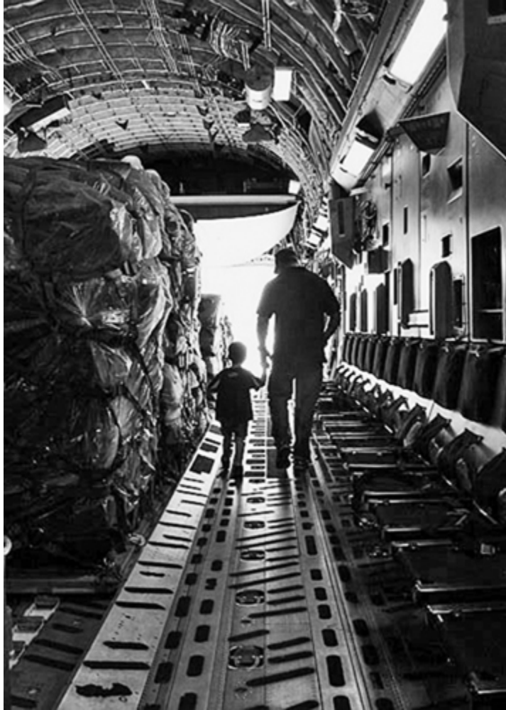
My son and I check out a C-17.