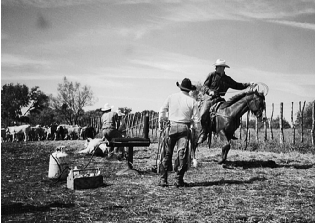
It's a rough way to make a living, but I'll always be a cowboy at heart.