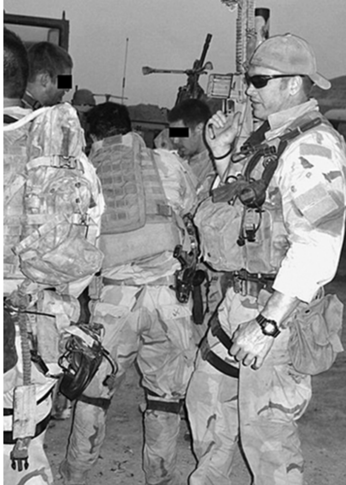
Here I am with the boys in '06, just back from an op with my Mk-11 sniper rifle in my right hand.