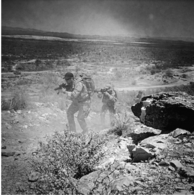
Leading a training session for Craft International, the company I started after leaving the Navy. We make our sessions as realistic as possible for the operators and law enforcement officers we teach.