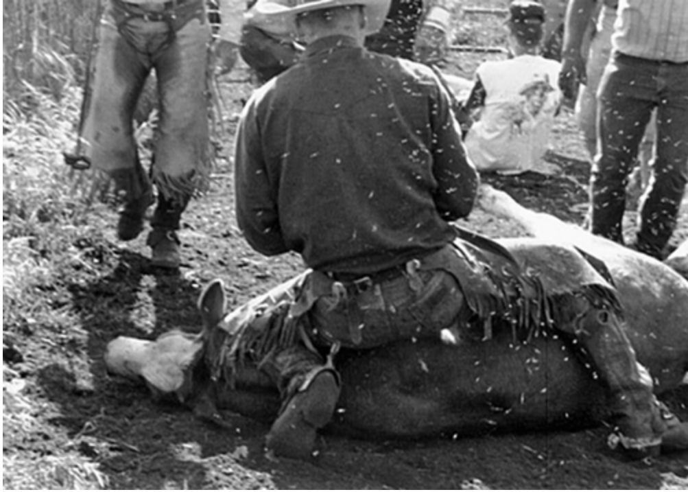
And I eventually got to where I was halfway decent at it.