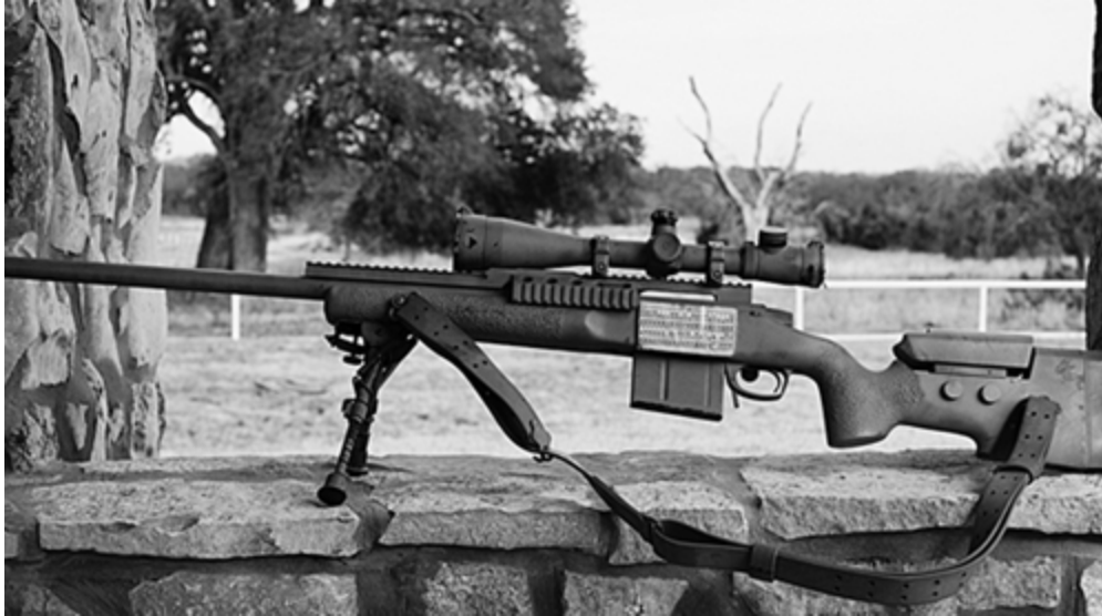
A close-up of my Lapua .338, the gun I made my longest kill with. You can see my "dope" card—the placard on the side contains the come-ups (adjustments) needed for long-range targets. My 2,100-yard shot exceeded the card's range, and I had to eyeball it.