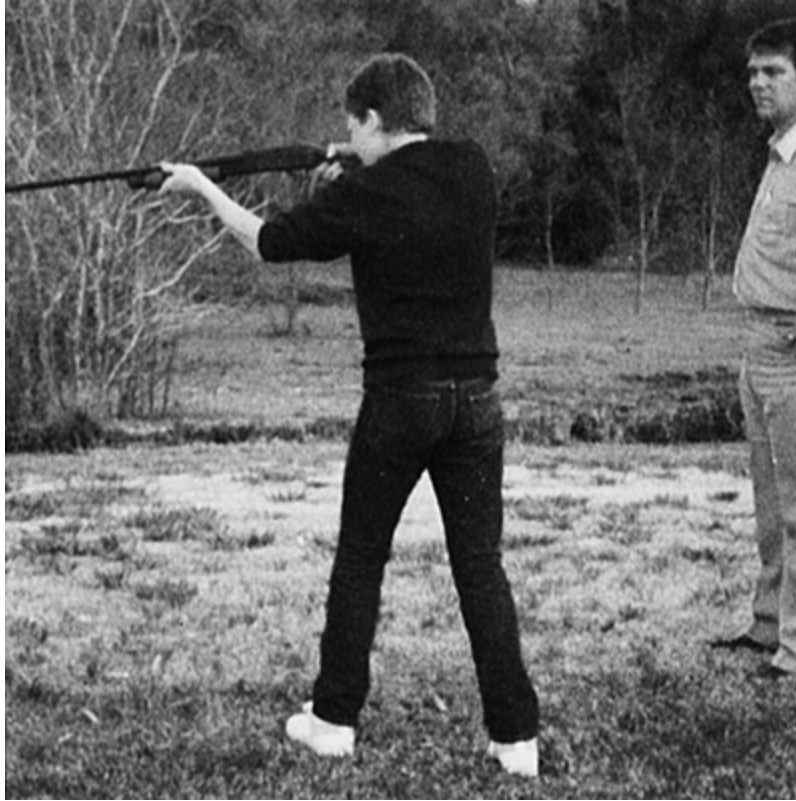
Here I am in junior high, practicing with my Ithaca pump shotgun. Ironically, I've never been much of a shot with a scattergun.