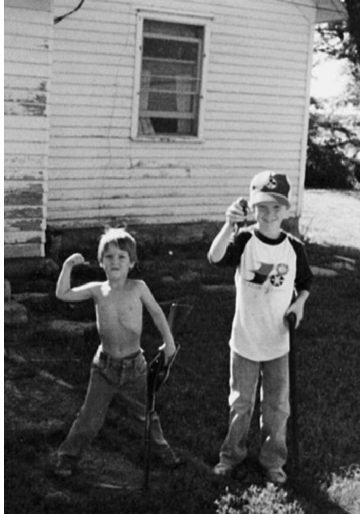
Young hunters and their prey. My brother ( left ) is still one of my best friends.