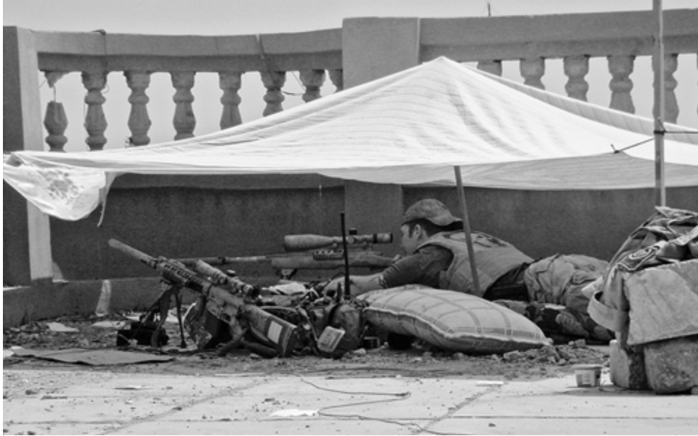
Set up on a roof in Ramadi. The tent provided me a bit of relief from the sun.