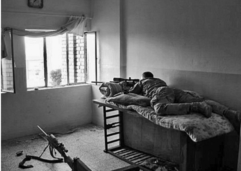
The sniper hide we used when covering the Marines staging for the assault on Fallujah. Note the baby crib turned on its side.