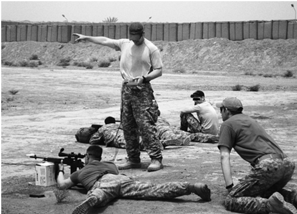
When not on the gun myself, I like to help others improve their skills. This was taken during my last deployment, while instructing a little class for some Army snipers.